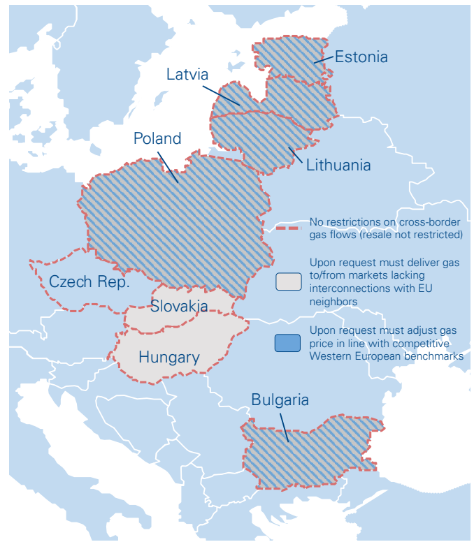
Figure 3: Overview of the Gazprom Settlement 6

The Commission has been concerned that Gazprom has used its dominant position in the gas supply market to obtain undue advantages with regard to access or control of infrastructure. These concerns applied particularly in two cases: the South Stream project in Bulgaria and the Yamal (EuRoPol) Pipeline in Poland. As regards South Stream, Gazprom will not seek damages as a result of the cancellation of the project, regardless of whether any benefits have been obtained. As regards the Yamal pipeline, the European Commission has found that the operator, EuRoPolgaz (co-owned by Gazprom) has not been able to block or delay any investments requested by the TSO, Gaz-System. Although no guilt has been proven, Gazprom will commit to refraining from influencing decisions regarding infrastructure to its advantage in the future.