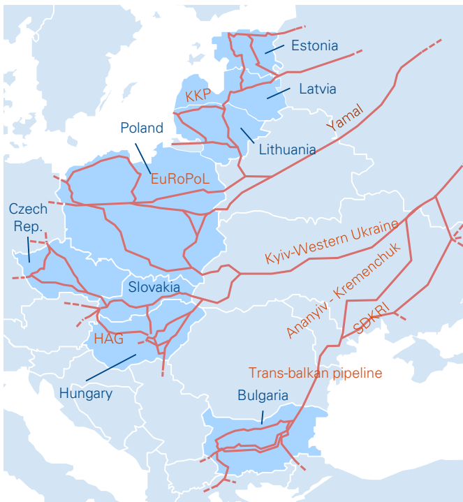
Figure 1: The eight affected member states and their pipeline connections with Russia

In September 2012, the European Commission opened formal proceedings against Gazprom for possible abuse of a dominant position in several gas supply markets in Central and Eastern Europe. In 2015, the allegations were more precisely formulated in a Statement of Objections, claiming that Gazprom was pursuing a strategy to divide gas markets, in breach of EU anti-trust rules, that prevented competition in the markets of Bulgaria, the Czech Republic, Estonia, Hungary, Latvia, Lithuania, Poland and Slovakia. The claim was based on three issues: (1) territorial restrictions on the resale of gas (2) unfair pricing policies, and (3) use of a dominant position to obtain unrelated commitments concerning transport infrastructure.